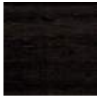
Black lacquered veneered wood