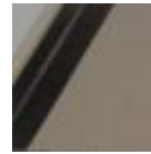
Matt Sand Antiscratch Glass