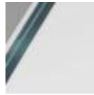
Extraclear Transparent Glass